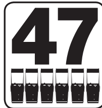
CLASSIC ARCADE GAMES

163 NEWARK AVE. JERSEY CITY, NJ 07302 infojerseycity@barcade.com