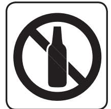
NO BOTTLED BEER