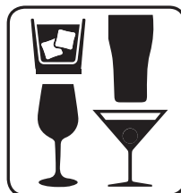
BAR TYPE FULL