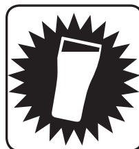
EXCLUSIVE BREWERY COLLABORATIONS