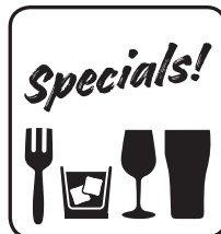
FOOD AND DRINK SPECIALS DAILY